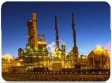
Coking & Refining