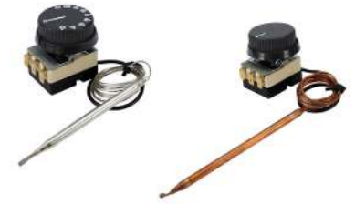
Thermostats with Bulb and Capillary