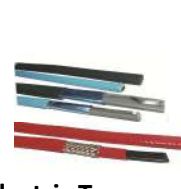
Electric Trace Heating