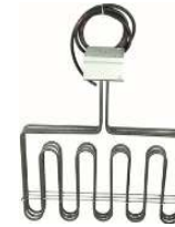
Ceramic Core Heaters