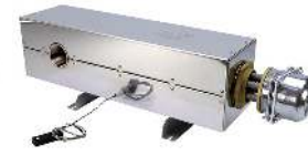
Fluid Circulation Heaters