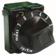
Bimetallic Energy Regulators