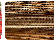
Paper & Cardboard