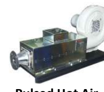
Pulsed Hot Air Generators