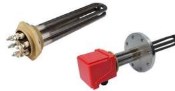
Screw plug, Flange, or Removable Immersion Heaters