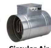
Circular Air Duct Heaters