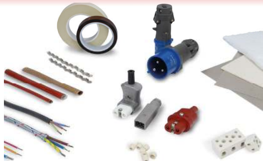
Wires, Cables, Thermometers, Round and Flat Pin Plugs, Heat Insulators and Electrical Insulators, Adhesive Tapes, Fans...