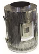
Energy-saving Band Heaters