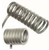
Formable Coil Heaters