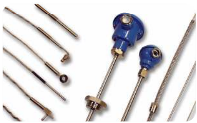
Thermocouples & Sensors