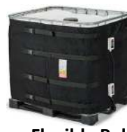
Flexible Belt 1000 Liters