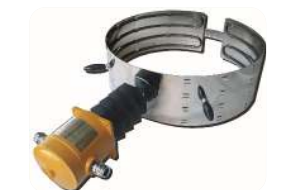
Belts for Drum Heating