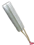
Process Air Heaters