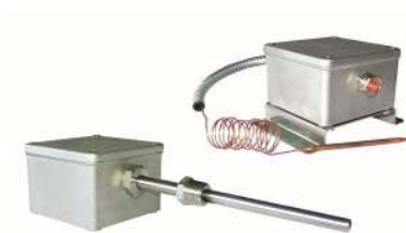
Thermostats with Bulb and Capillary, with Box