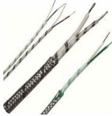
Cables for Thermocouple