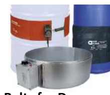
Belts for Drum Heating