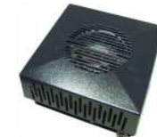
Fan Convection Heaters