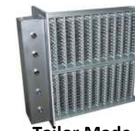
Tailor Made Air Duct Heaters